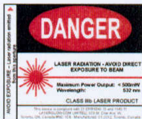
Figure 1: Danger Label

If you have any more questions or concerns regarding the safe and proper operation of our products please contact us.