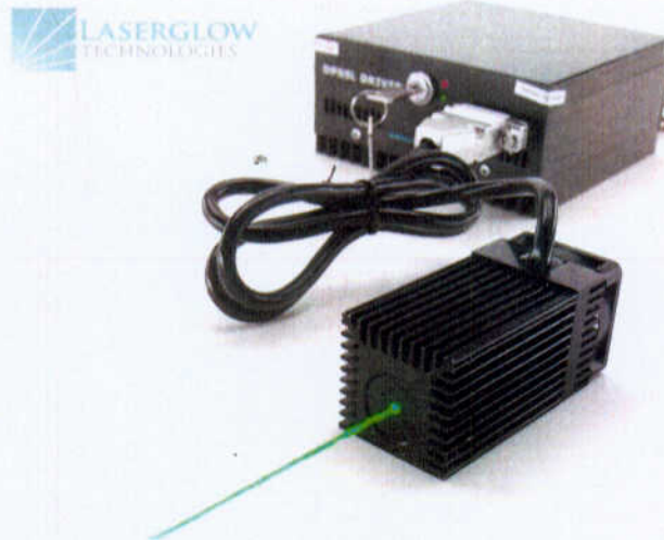
Product may not be exactly as shown