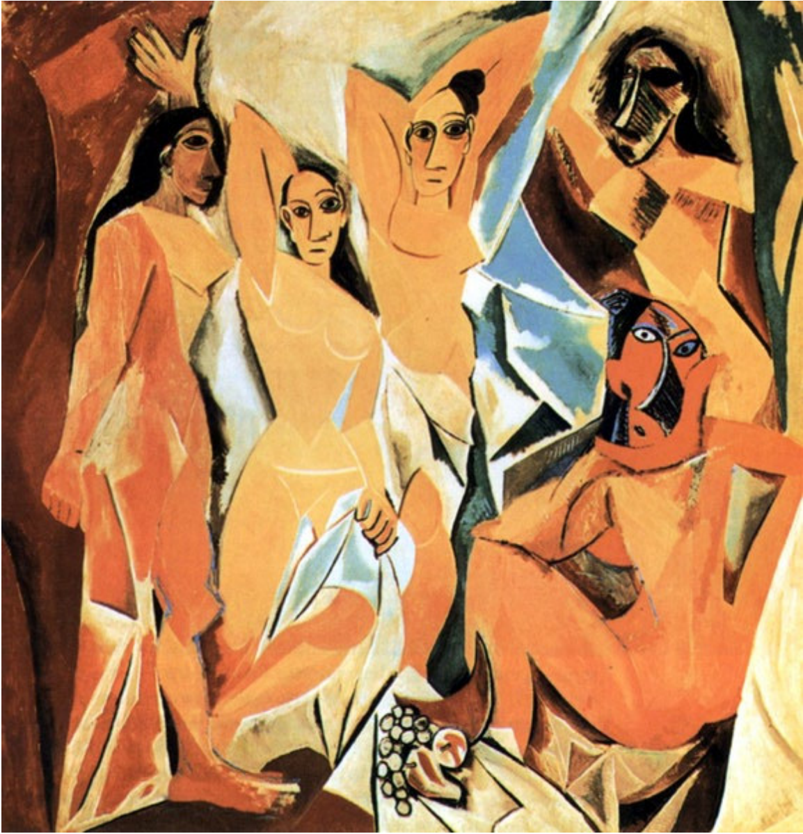
Plate 1: Les Femmes d'Alger . 1907. Pablo Picasso.

inspiration. 3 Painters such as Paul Gauguin and Henri Rousseau (see plates 2 and 3) felt that it was necessary to abandon urbanism and 'advanced' European culture and search for something more idyllic in rural or primitive settings.