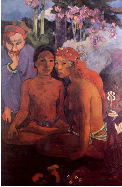
Plate 2: Contes Barbares . 1902. Paul Gauguin.

audiences as Demoiselles . Indeed, Picasso was an admirer of Stravinsky. 5