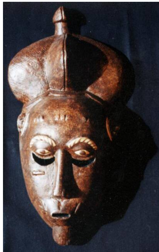
Plate 4: African mask.

(plate 4), and Picasso himself acknowledged that he was eventually very influenced by fetishes.