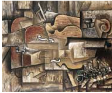
Plate 5: Violin and Grapes . Pablo Picasso.

civilized Europe. 10 What struck Picasso most about the fetishes was not their form, although this was certainly evident in his paintings, but their spirit. As Picasso said, “The masks weren’t just like any other pieces of sculpture. Not at all. They were magic things . . . they were weapons. To help people avoid coming under the influence of spirits again, to help (the Africans) become independent. They’re tools. If we give spirits a form, we become independent. Spirits, the unconscious, emotion—they’re all the same thing. I understood why I was a painter.” 11