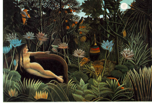
Plate 3: The Dream . 1910. Henri Rousseau.