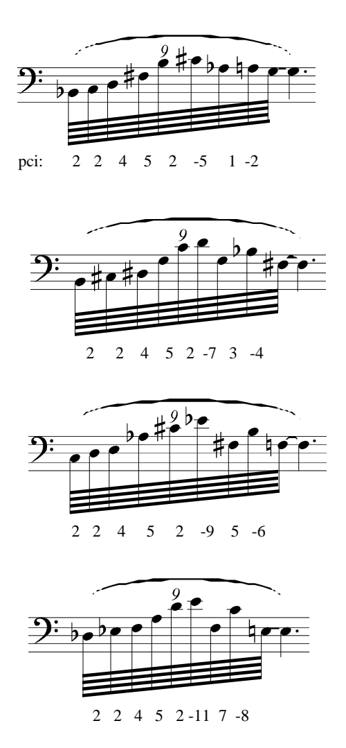
Figure 2 The first 4 occurrences of a motive from Messiaen's Vingt Regards sur l'Enfant J ésus (III-L'échange) .

In the example of figure 2, if the patterns are represented by absolute pitch no interesting matches occur; if encoded as pitch intervals in semitones then the first 5 intervals are matched; if encoded as step-leap strings then the whole patterns are matched (of course contours match as well but step-leap matching is more accurate).<sup>2</sup>