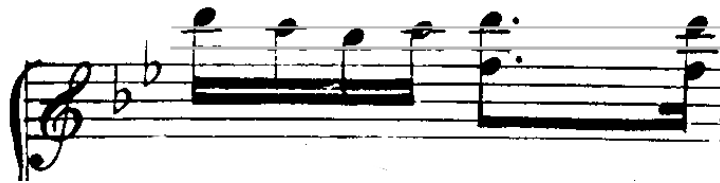
Fig. 2. An example of poorly aligned ledger lines. The grey lines are perfectly horizontal and were added for emphasis.

Determining the correct staff line location of notes on the staff is relatively easy, since most scores have relatively parallel staff lines, pitch can be determined by a simple distance calculation from the center of the staff. However, one of the most difficult problems in determining pitch is dealing with notes outside the staff. Such notes, which require the use of short "ledger" lines, are often placed very inaccurately in hand-engraved scores (Figure 2). The most reliable method to determine the pitches of these notes is to count the number of ledger lines between the notehead and the staff, as well as determining whether a ledger line runs through the middle of the notehead.